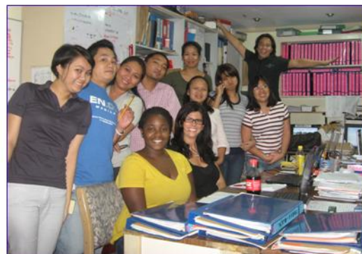
PGH team hard at work during October site visit

Special thanks to Philippine General Hospital for accruing the most patients! Not only did they enroll 38% of the total number of patients, they worked diligently as a team to assure quality patient care and patient data.